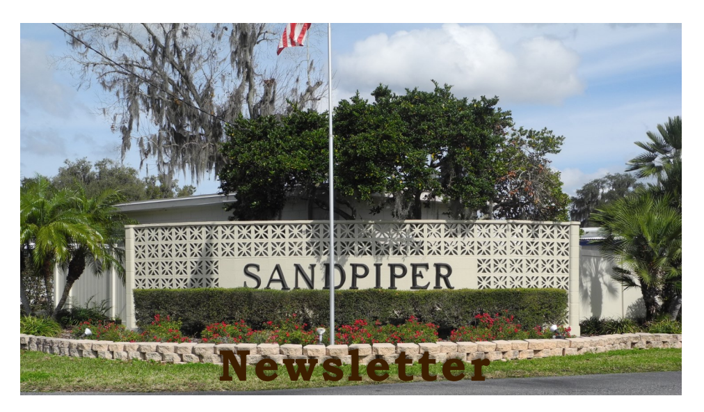
November 2023 Issue